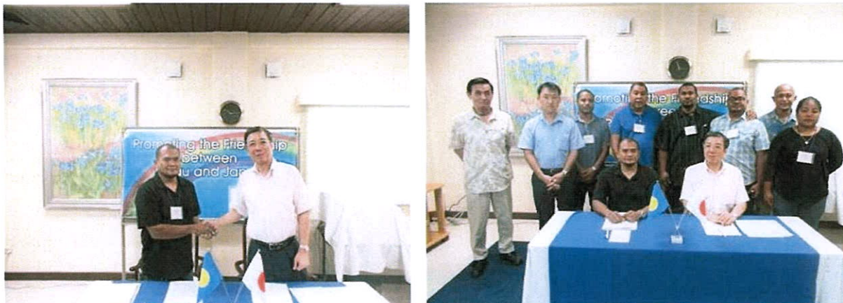
Signing of the Grant Contract on February 23, 2018

The Embassy of Japan in the Republic of Palau awarded the sum of $136,066.00 to Koror State Government for the procurement of a Wood Chipper and a Paper Shredder pursuant to a Grant Contract executed between the Embassy of Japan and Koror State Government on February 23, 2018, as shown below: