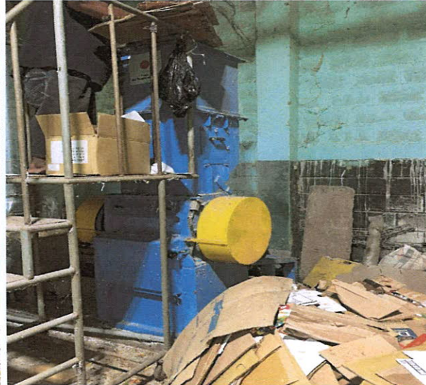
Wood Chipper (KSG 3311)

Koror State Government's Response: I am in receipt of the Draft Audit Report on Japan's Grant Assistance for Grass-Roots Human Security Project for "The Project for Reconstruction of Koror State Recycling Center" specifically to procure a Wood Chipper and a Paper Shredder, and I concur with the findings.