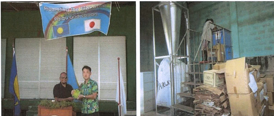
Handover ceremony on September 26, 2018

The Paper Shredder arrived on July 17, 2018 while the Wood Chipper arrived on August 20, 2018 in Palau. The Paper Shredder and Wood Chipper were turned over to Koror State Government on September 26, 2018 in a formal Handover Ceremony as shown below: