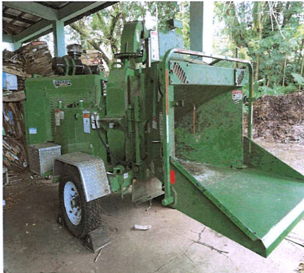
Wood Chipper (KSG 3311)

Based on our audit, the Office of the Public Auditor found that Koror State Government administered the GGP grant in compliance with the terms and conditions of the Grant Contract, Side Letter and the GGP Procurement guidelines. In addition, Koror State Government's Solid Waste Management maintained proper controls over the paper shredder and wood chipper and all the records pertaining to the procurement. Therefore, there are no findings to this audit report.